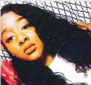
Rianna Rich Memorial High School