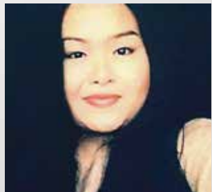
Chau Tran Memorial High School