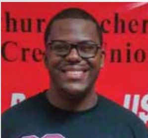
Jeremy Daniels Memorial High School