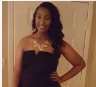
Kennedi Lofton Memorial High School