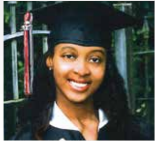
Aliyah Charlot Memorial High School